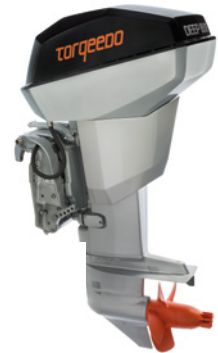
Deep Blue 25/50 R