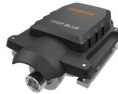
Deep Blue 25/50 i

This 100 kW motor was specifically constructed to power fast, planing motorboats. With a reliable, low-maintenance, direct-drive design, the Deep Blue 100i delivers extraordinary performance, with up to 2,700 RPM and a torque of 437 Nm.