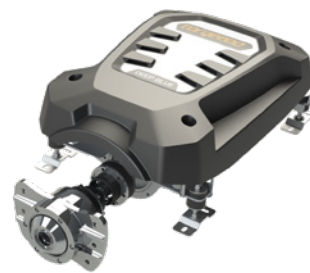
Deep Blue 100 i