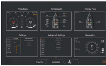
Main menu: Navigate easily between different categories.

This integrated, modular system provides comprehensive energy management for larger vessels or those with complex energy requirements. Each component's energy demands are monitored and managed by the central system, ensuring economical collection and distribution of renewable energy with automatic generator backup.