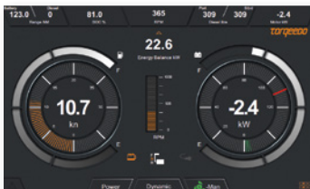
Drive screen: All important information needed while motoring. You can choose to display or hide the information line at the top.