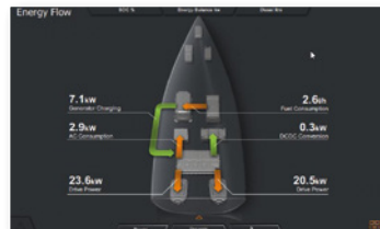
Energy flow: Understand your system's power balance & energy flow at a glance.